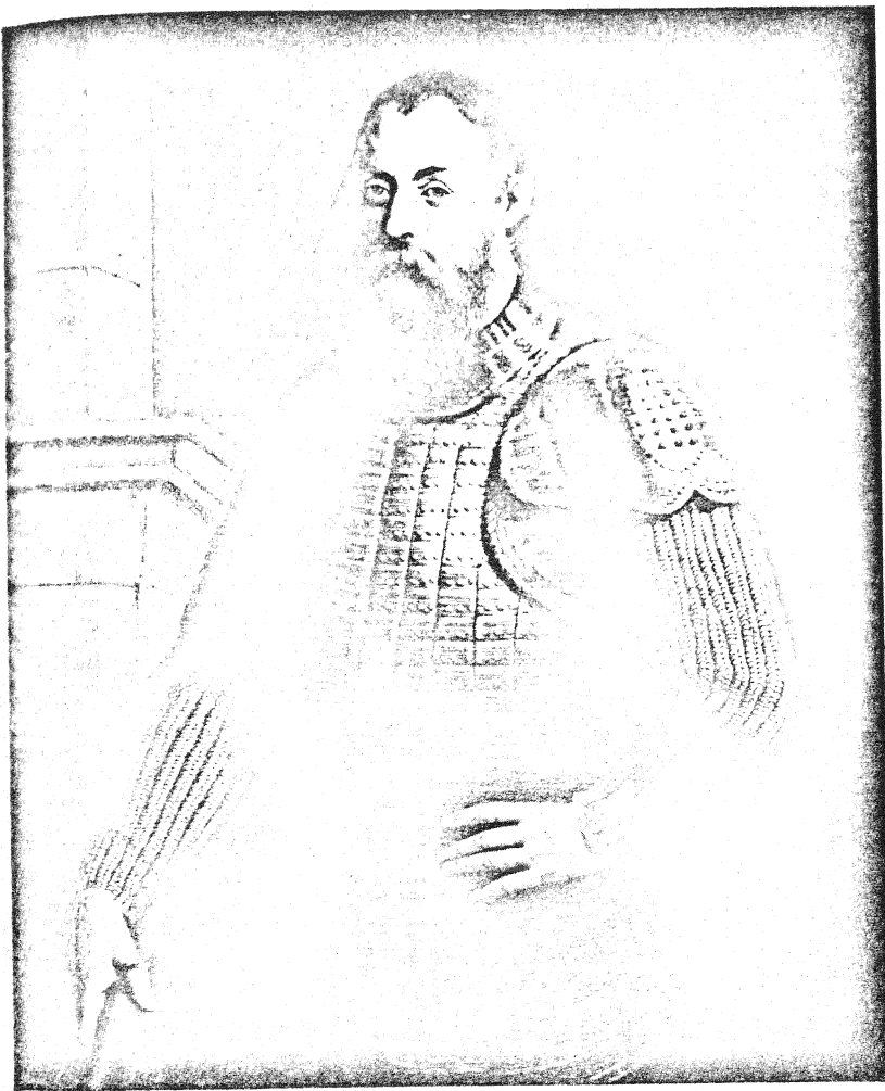
Plate 72 HUGH O'NEILL IN ARMOUR (Page 358)