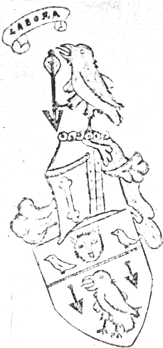
Plate 74 ARMS OF DOUGLAS THURSTON MCKEE OF CHATHAM, ONTARIO (Page 415)